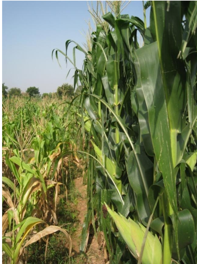
Left: Local maize variety Right: Improved maize variety